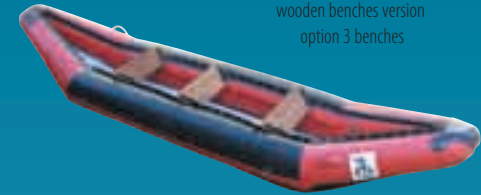
wooden benches version option 3 benches