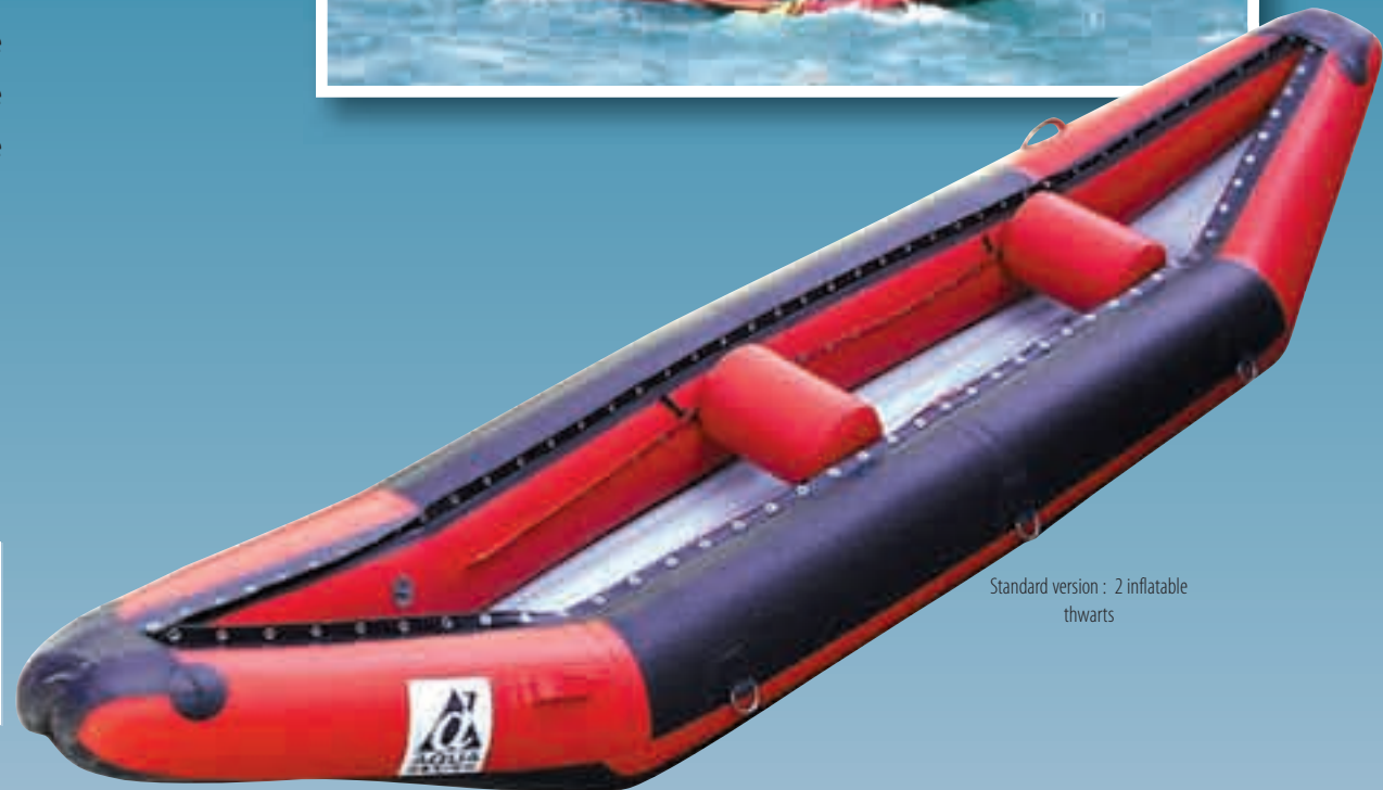
Standard version : 2 inflatable thwarts