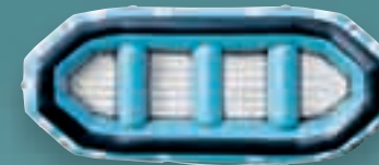
SILVER CLOUD 425