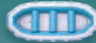
SILVER CLOUD 410