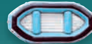
SILVER CLOUD 375