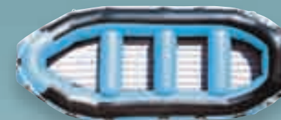
SILVER CLOUD 465