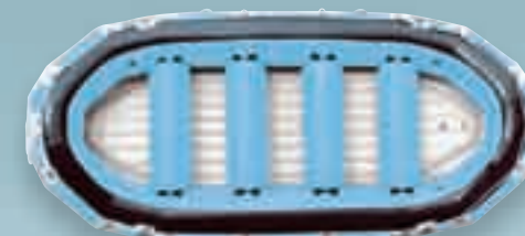
SILVER CLOUD 490