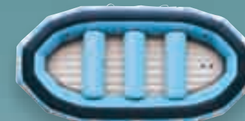
SILVER CLOUD 435